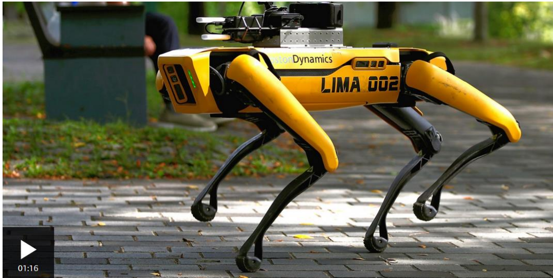
Coronavirus: Robot dog enforces social distancing in Singapore park